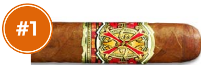
FUENTE FUENTE OPUSX