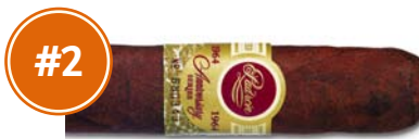
PADRÓN 1964 ANNIVERSARY SERIES